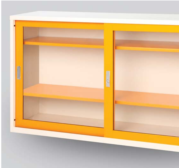
Doors not supplied by P C Henderson

When it comes to finishing wardrobes, cupboards, bookcases and other pieces of high quality cabinet work, the Loretto range is ideal. It has been designed to work with timber framed, glazed and flush doors up to 23kg in weight, up to 900mm wide, and between 20-45mm thick. Three kits are available giving a maximum opening width of 1800mm and the nylon guides and rollers and aluminium rail ensure it works smoothly and quietly.