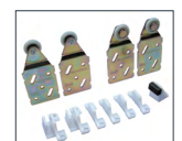
2 Door Fittings Kit (W02)

View our full range of door handles and flush pulls on pages 128 and 129.