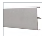
Brushed Aluminium Fascia (F138/****) for doors up to 25mm thick