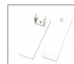
End Cap Pack for F138 Fascia (F138/ECP)