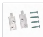
Guides for 81X Channel (113/81X) 2 per door